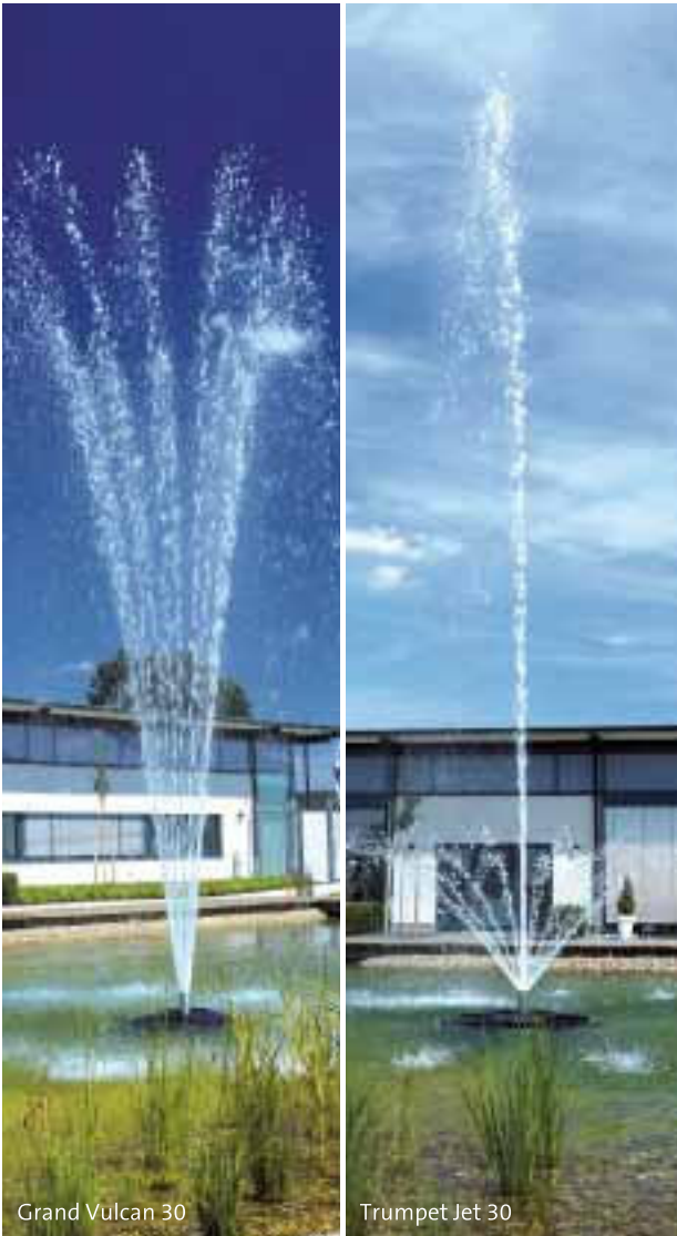
Grand Vulcan 30